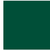
Moss Green RAL 6005 (Matte, Gloss or Textured)